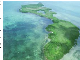
Big Munson Island