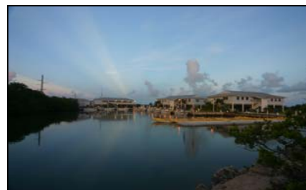
Brinton Environmental Center at sunset

needed office and conference space. In 2001, through the generosity of the Brinton Trust, the J. Porter Brinton Environmental Center was dedicated, allowing even more Scouts and Venturers to participate in the adventures of the sea.